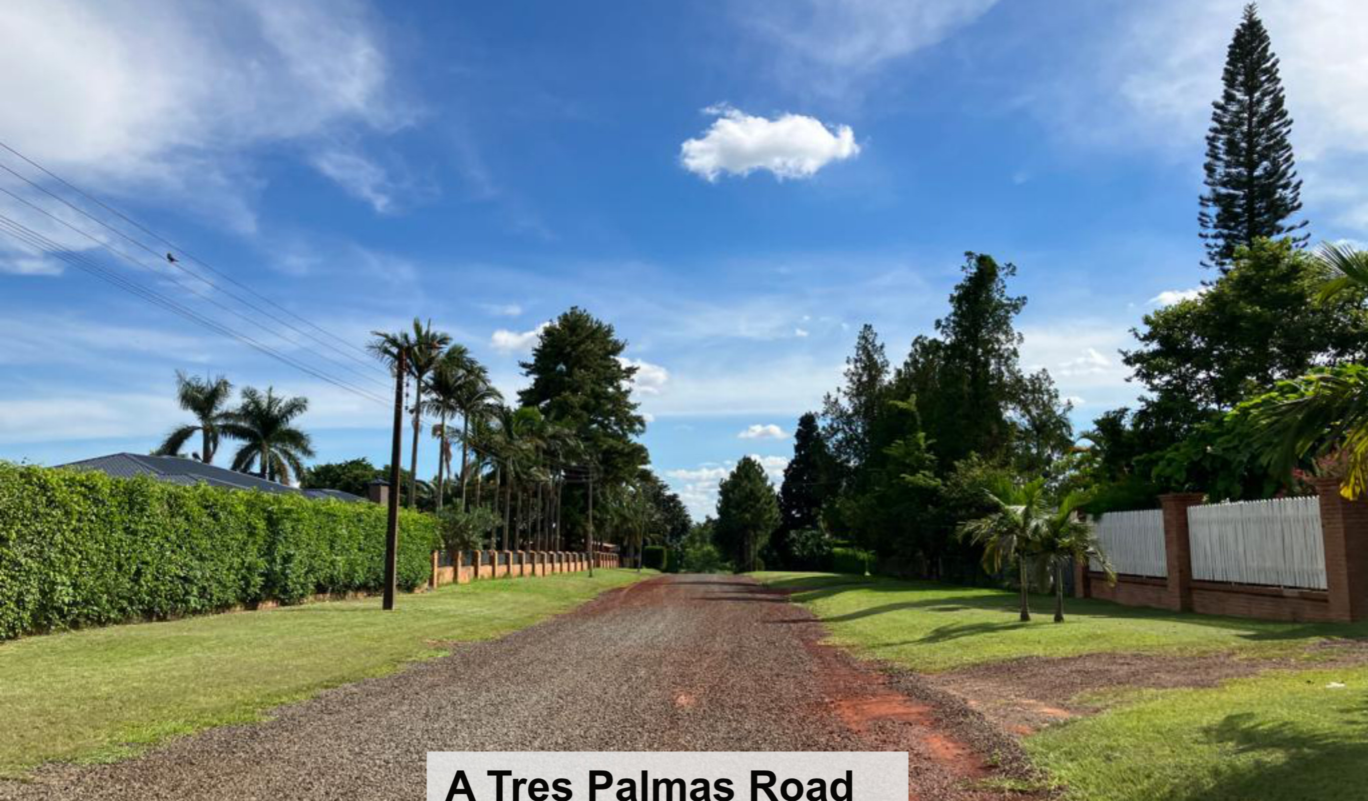
A Tres Palmas Road