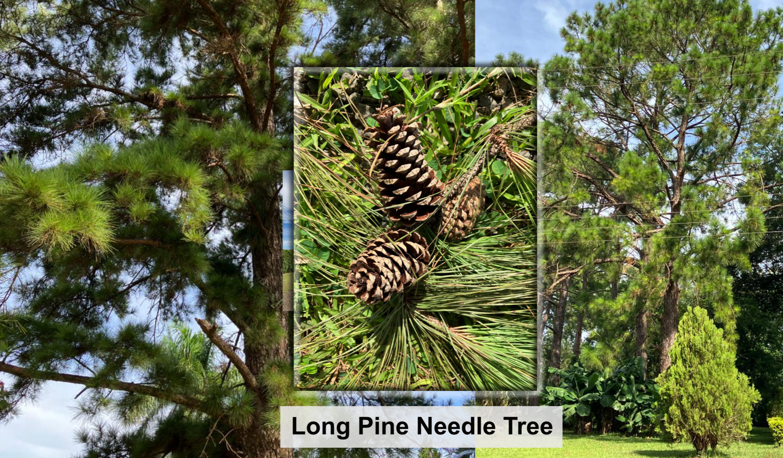
Long Pine Needle Tree