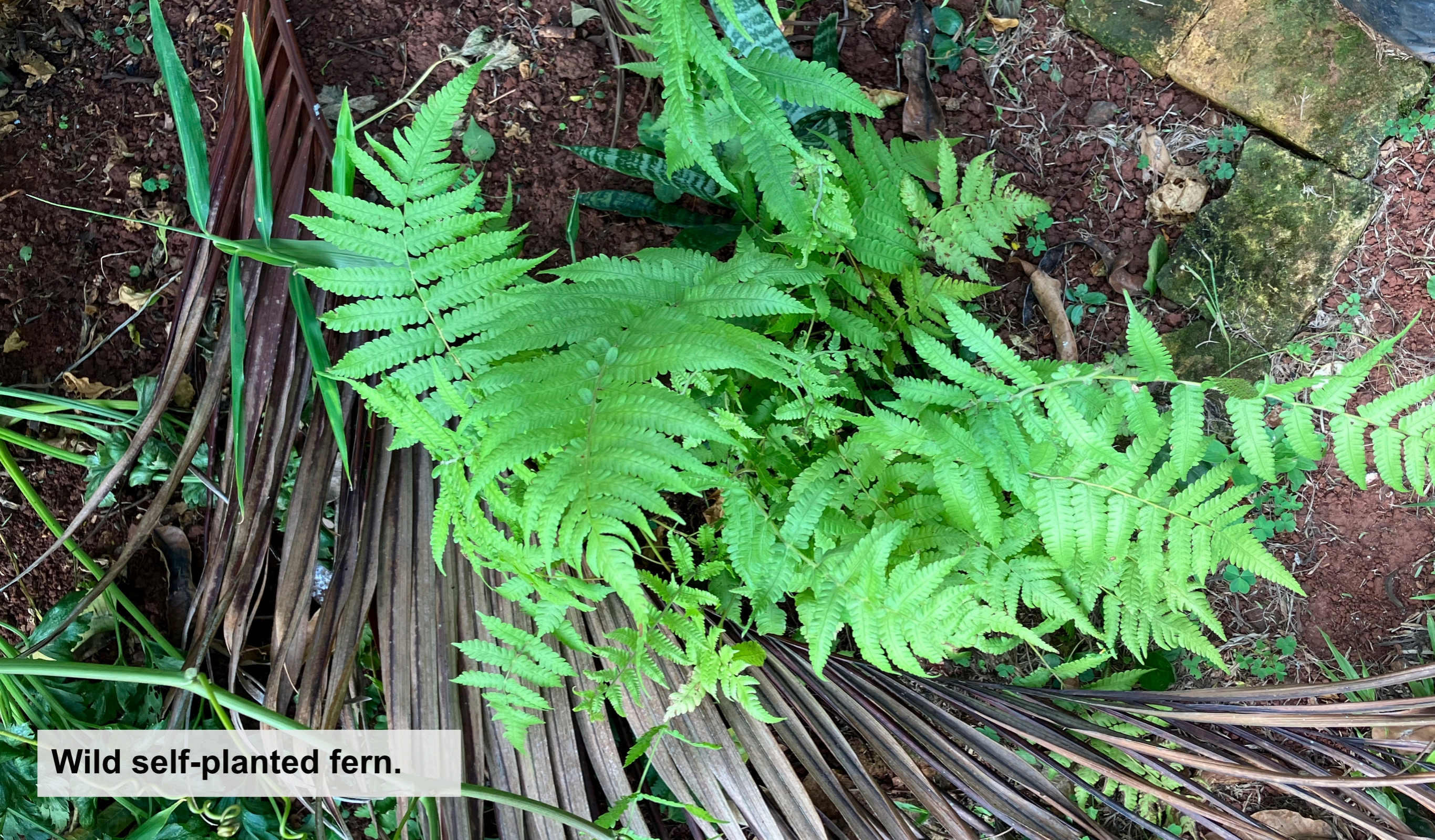
Wild self-planted fern.