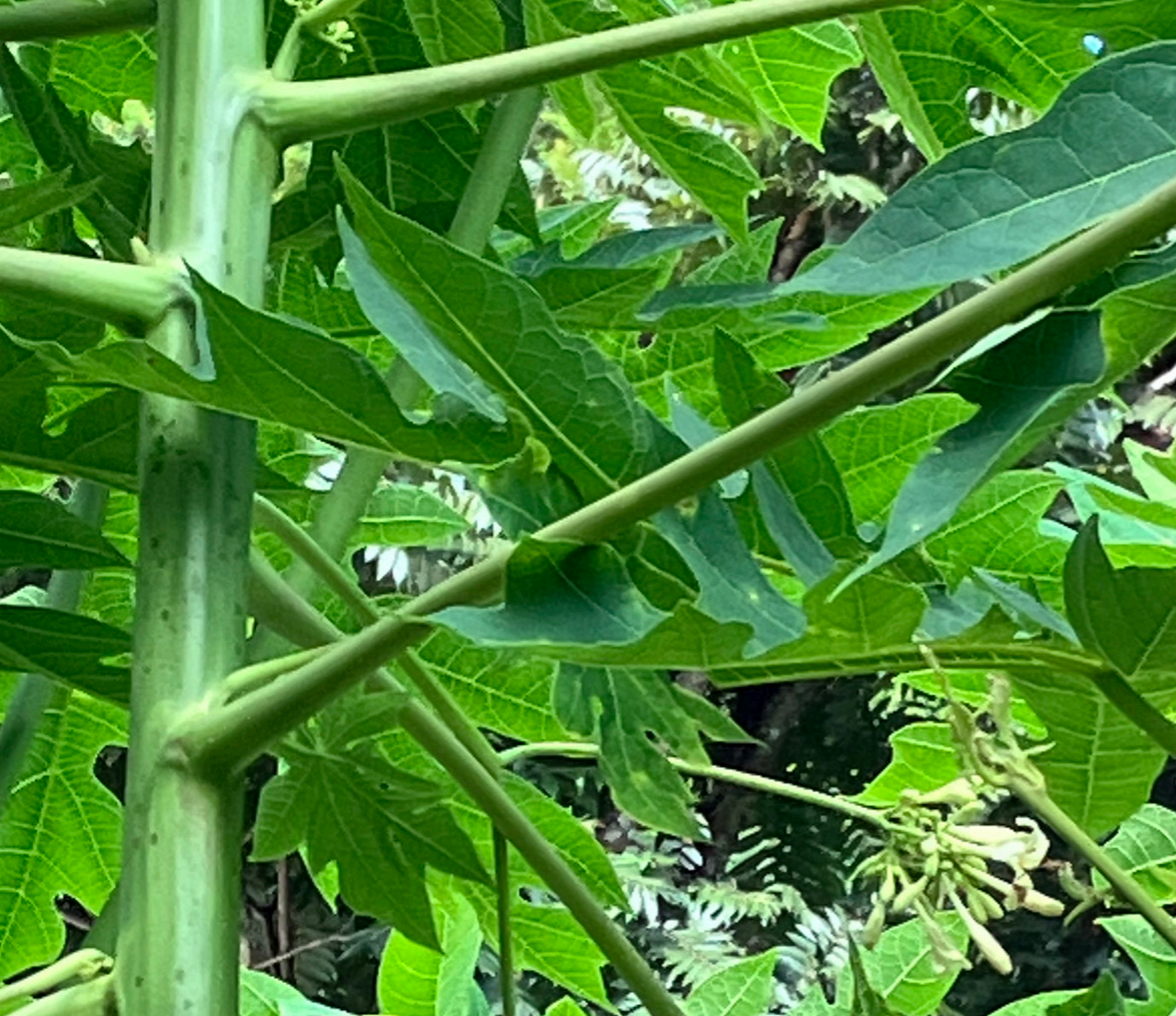
Male Papaya Tree. Notice the long flowered stems.