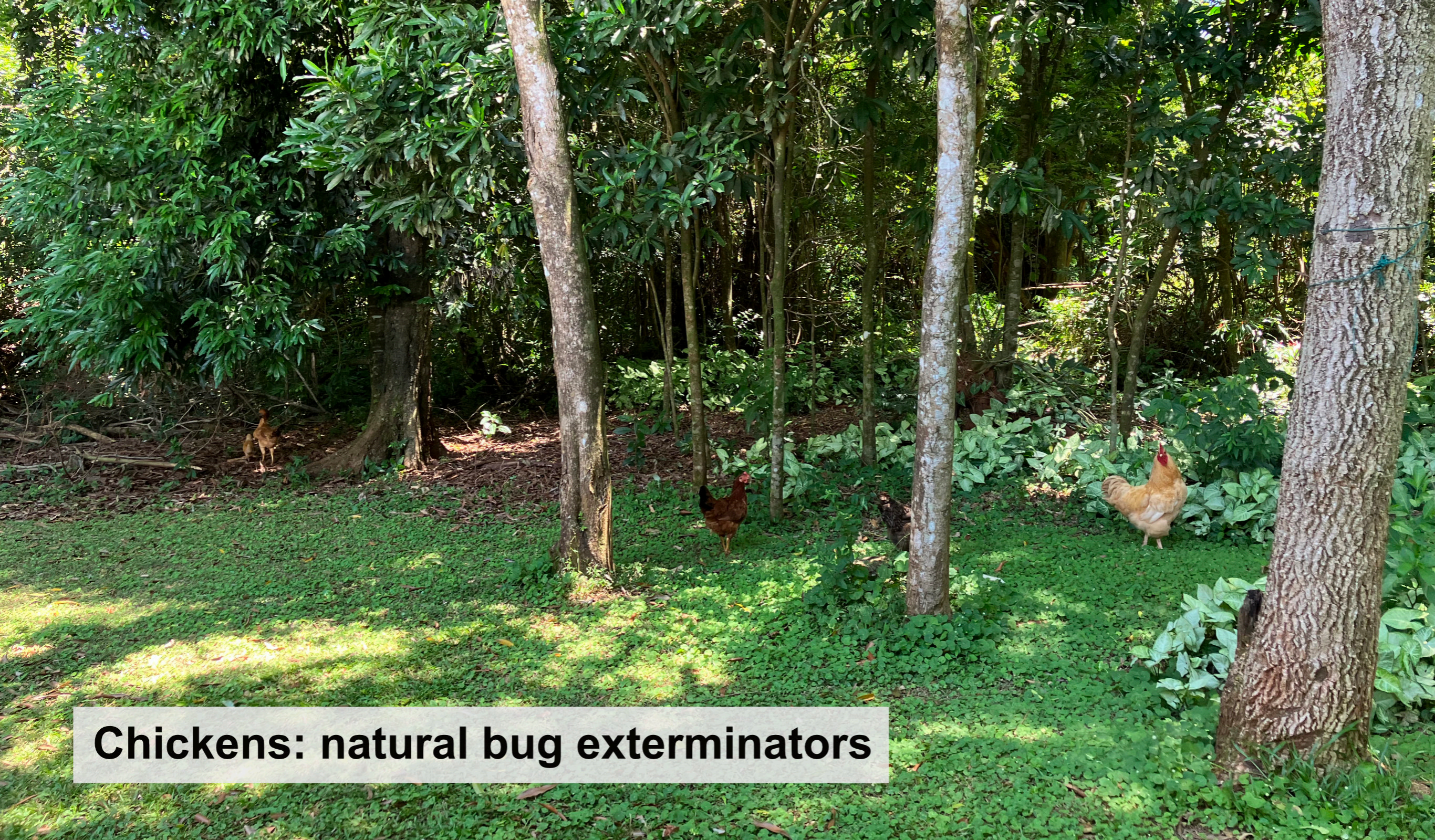
Chickens: natural bug exterminators